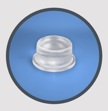
Large (I-O41O) DIAMETER .500" (12.7mm) HEIGHT .250" (6.4mm) Sheet of 40